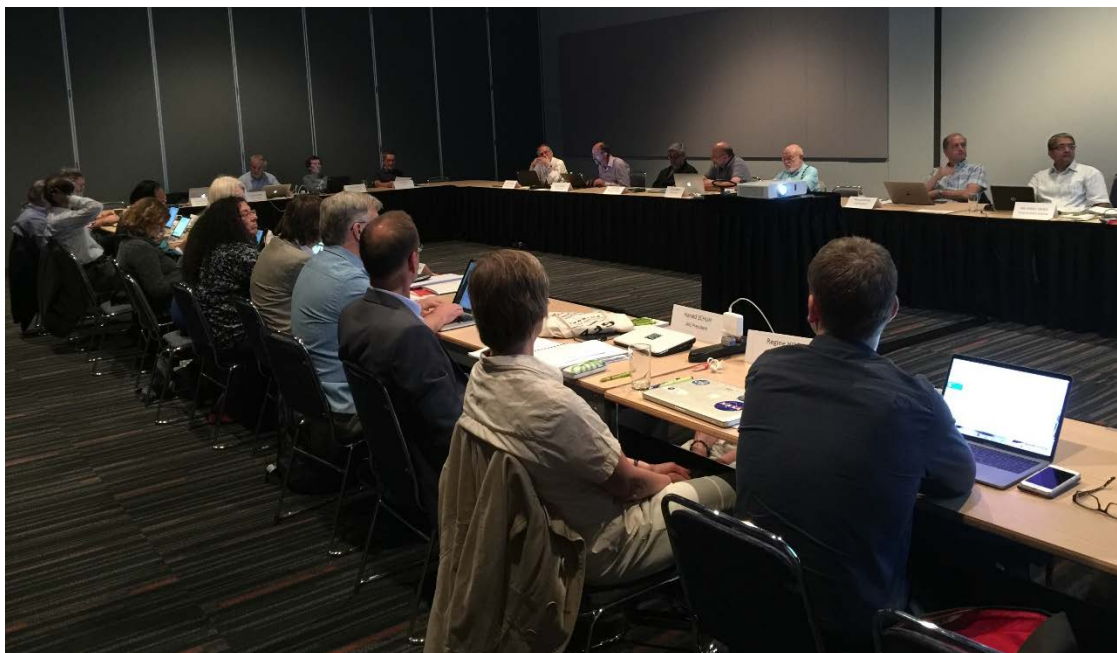
During the EC meeting, 20 September 2017, Palais des congrès, Montreal, Canada

of the IUGG liaisons to the ICSU Scientific Committees and to international and intergovernmental organizations; (vii) Union activities on capacity building and education; and (viii) a report on the implementation of the IUGG Strategic Plan.