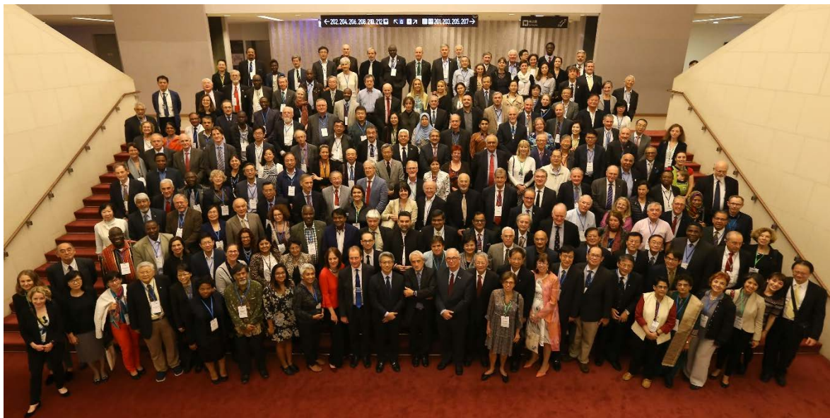
Participants of the ICSU-ISSC joint general assembly