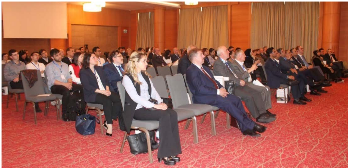
At the UPCB2018 conference

knowledge of geoscience and on the application of remote sensing to studies of environmental problems related to the Caspian basin. 31 students and young researchers and nine international and local experts specializing in remote sensing and geoscience lectured at the workshop.