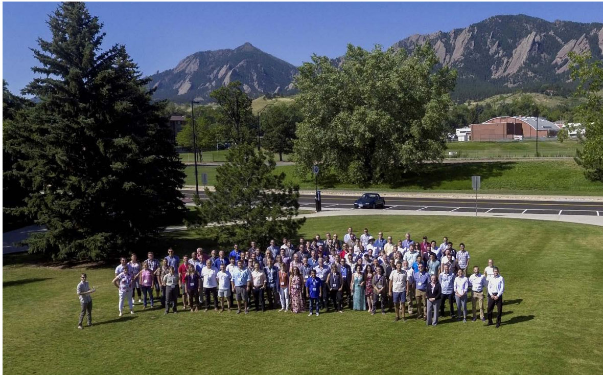
Conference group photo

instrumentation for deployment on UAS, recent and upcoming field campaigns, and aircraft development. The industry exhibit session provided opportunities for meeting participants to interact with vendors from several companies and learn about UAS-specific instrumentation, platforms and services related to the deployment of these systems for atmospheric research.