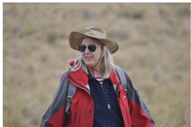
October 2019, looking for pyroclastic sequences in Carapacho volcano, Payenia Volcanic Province.

I was born in Buenos Aires City. My parents had a little farm on the outskirts of Buenos Aires, every weekend I used to enjoy horseback riding and countryside activities such as climbing trees. I enjoyed camping and was interested in nature, animals and all its wonders. I decided that rocks were better than cruel animal experiments so did not study Biology. I received my Bachelor's Degree in Geology from Buenos Aires University (UBA) in 1977, with an original study of a new-born volcano in the Lanin National Park.