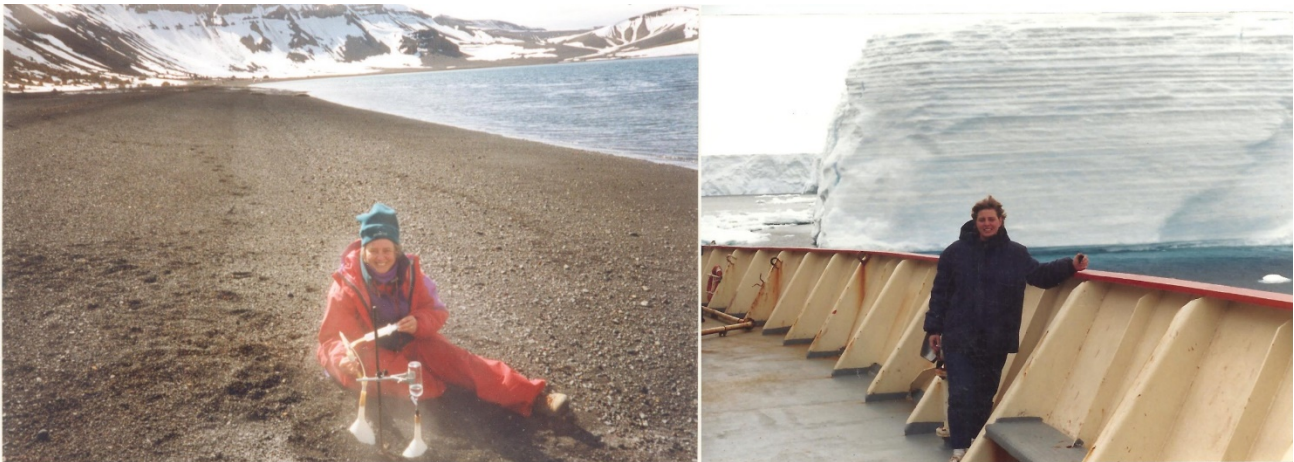
Left: Taking volcanic gas samples in Deception Island, Antarctica. Right: At the Almirante Irizar icebreaker, in Weddell Sea, on route to Deception Island.

In 1988, I started to work under an agreement between the UBA and the Argentine Antarctic Institute in Deception Island, in the South Shetland Islands, Antarctica.