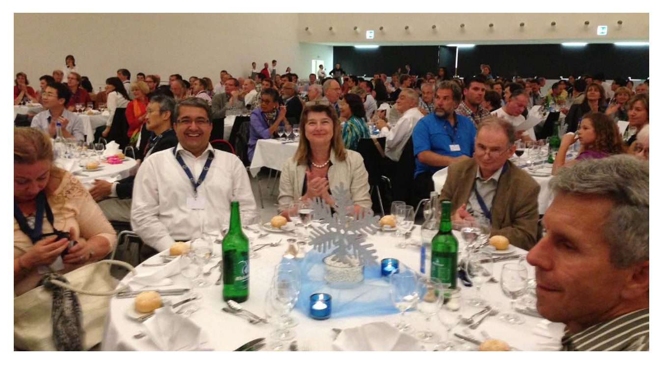
At the Davos Atmosphere and Cryosphere Assembly DACA-13, 8-12 July 2013

I enclose a picture from our DACA-2013 Atmosphere and Cryosphere Assembly meeting in Davos, remembering fondly past in-person meetings which were so pleasurable and rewarding. Let's hope for a future where we can all meet in person again!