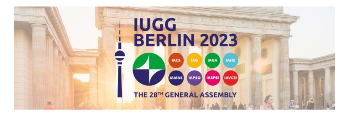
Welcome from the Local Organizing Committee (LOC)