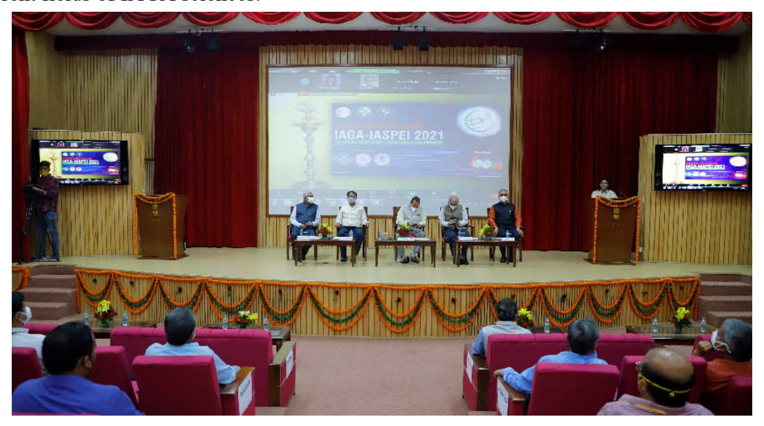
The opening ceremony of the IAGA-IASPEI Joint Scientific Assembly 2021 was attended in person by selected local participants and streamed online for all others

The Joint Assembly was preceded by the IAGA and IASPEI Schools for Early Career Scientists and a GIFT Workshop to educate teachers from India and neighbouring countries on IAGA and IASPEI topics (see special reports below). All these also were organised for the first time in virtual formats. The International Association of Physics Students, IAPS, that signed a memorandum of understanding for collaborations with IAGA earlier this year, organised another virtual event (IAPS@IAGA) where Early Career Scientists could discuss in small groups with international experts in different fields of IAGA sciences.